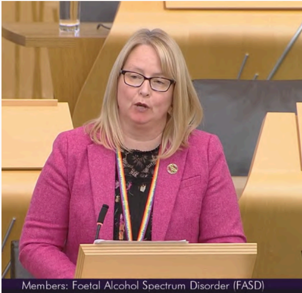
Members: Foetal Alcohol Spectrum Disorder (FASD)